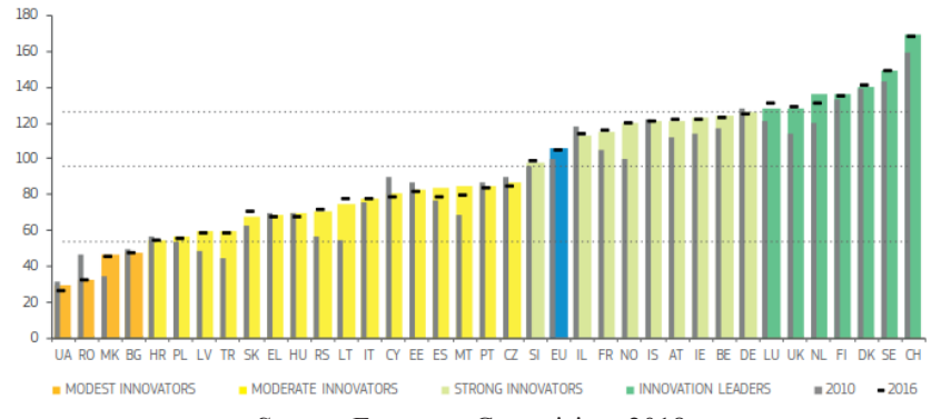
Figure 1. EIS 2018 - Performance of European and non EU countries' systems of innovation