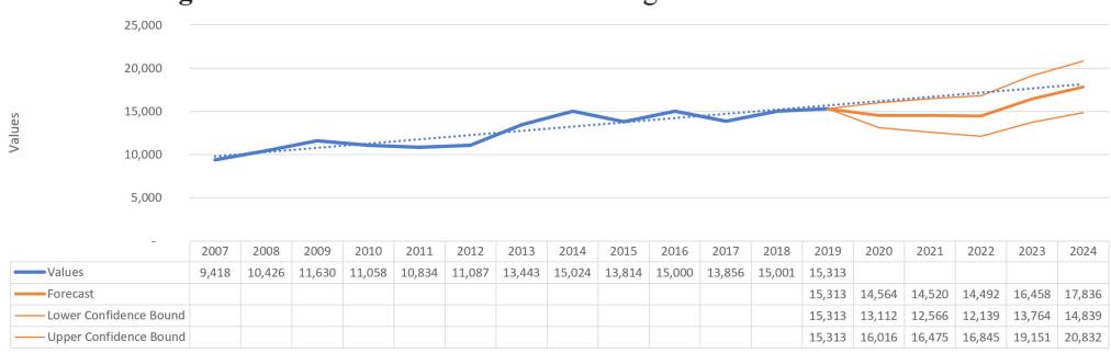
Figure 3. Forecast tendencies of values of agricultural services in Serbia