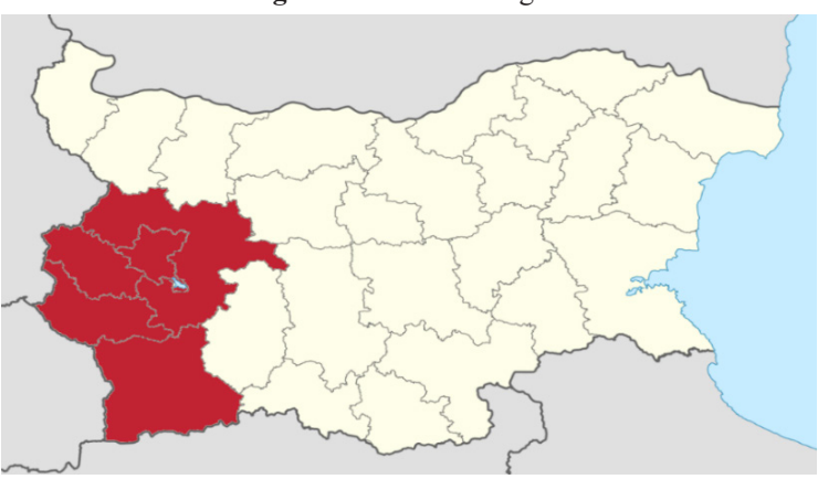
Figure 1. Southwest region

The Southwestern region follows the general trend of negative natural growth in the country. Thanks to Sofia-city district, the natural growth is only minus 4.3% for 2018, compared to minus 6.5% for the country. There are big differences in the region, the lowest being the natural growth in Pernik district (minus 11.9%) and Kyustendil district (minus 13.4%) for 2018, while for the capital it is only minus 1.9%.