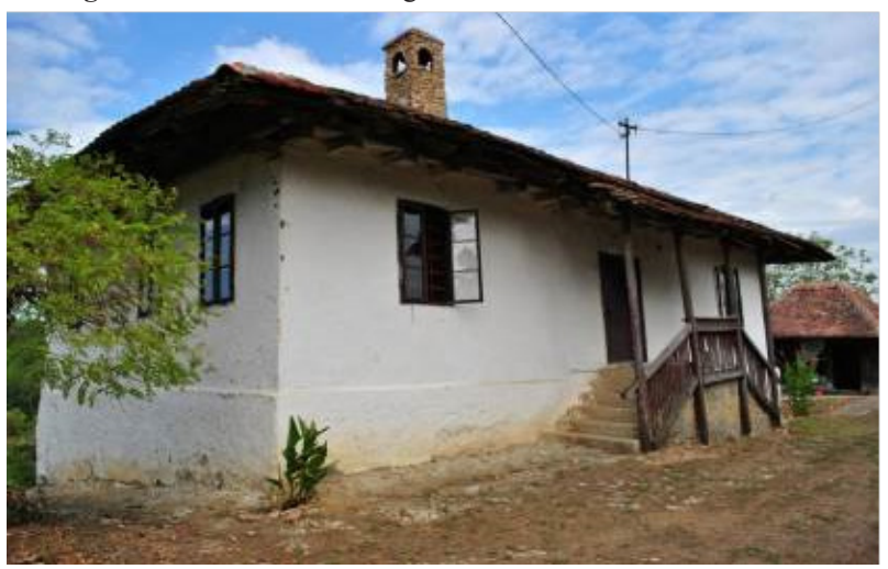
Figure 2. Rich cultural heritage - Tešman Soldatović's homestead

The good geographical position of the destination of Podgorina, adequate traffic connections with emission centers, and preserved nature, natural and anthropogenic factors, numerous and colorful cultural heritage (material and immaterial) ( Figure 2 ), many manifestations, among which the Plum Fair is one of the most famous and in the most important plum farming not only in Serbia but also in the surrounding area, provide an excellent basis for the development of this type of tourism in this destination ( Figure 3 ). Natural resources along with cultural heritage represent an important factor in the development of rural tourism in the Republic of Serbia (Cvijanović, et al., 2022).